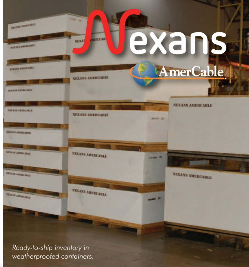
Ready-to-ship inventory in weatherproofed containers.